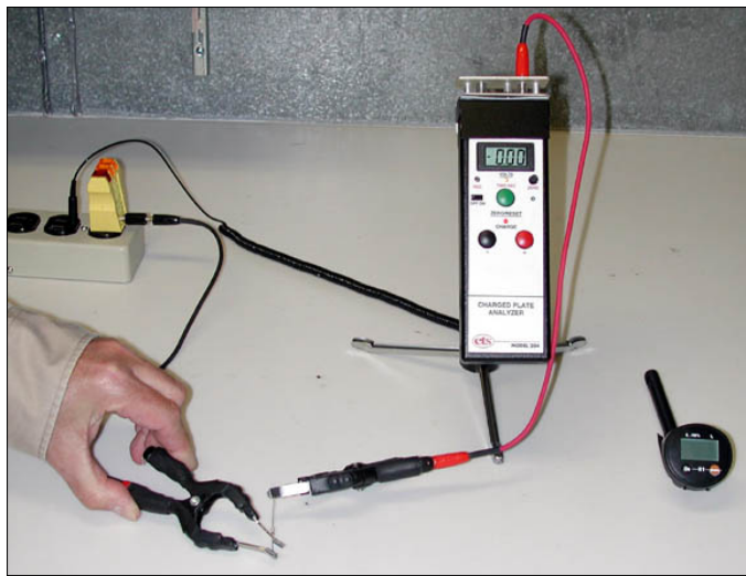
Figure 3-1: System verification test set up

Set the measurement parameters for a 1000 Volt charge. NOTE: The actual charging voltage is approximately 1100-1200 Volts or more, but the decay time measurement starts when the voltage on the part reaches 1000 Volts and stops at the 10% (100 Volt) cut off. Apply the charging voltage for approximately 2 seconds. Release the Charge button and quickly connect the grounded