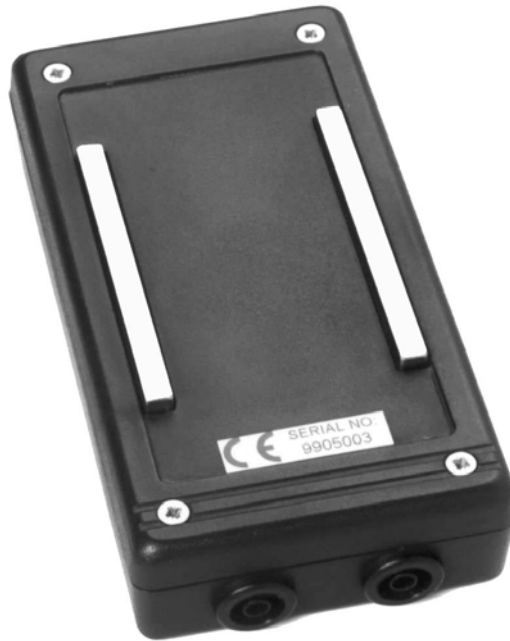
Figure 1-2: Electrode configuration

Two auxiliary input banana jacks enable the user to plug in virtually any type of resistance measurement electrode having cables with standard 0.161" (4mm) banana plugs that converts the Model 880 to an independent wide range resistance indicator. When the auxiliary probe banana plug is inserted the built-in parallel bar electrodes are automatically disconnected. The supplied ground cable enables resistance-to-ground (RTG) measurements to be made by disconnecting one of the parallel bar electrodes and using the other parallel bar as the surface electrode for quick checks.