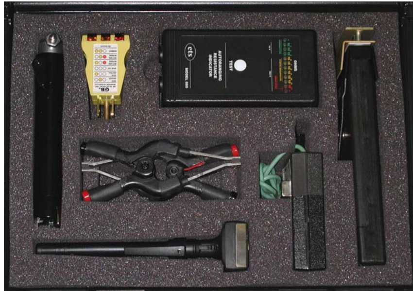
Figure 2-1: Model 204 SAE J1645 Test Kit

The included tripod is used to hold the Model 204 in either a vertical or horizontal position to facilitate measurements.