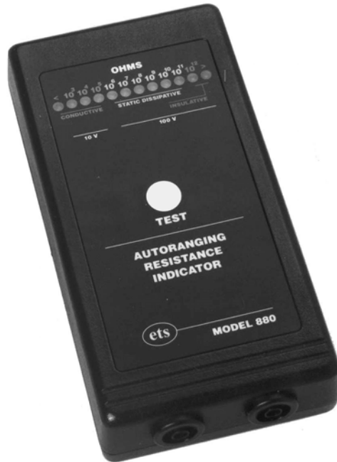
Figure 1-1: Model 880 Autoranging resistance Meter

The Model 880 Autoranging resistance Indicator, shown in Figure 1-1, is a CE certified, precision, easy to use instrument that incorporates features found only in more expensive units. Twelve (12) LEDs indicate the Conductive (Green), Static Dissipative (Yellow) and Insulative (Red) ranges in one (1) decade steps from <10^3 to >10^{12} Ohms.