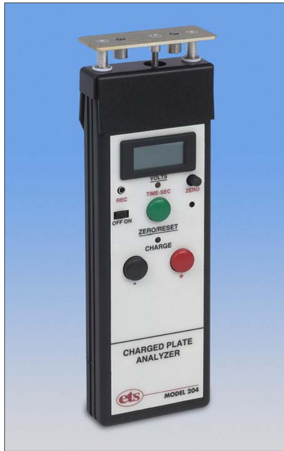
Figure 2-2: Model 204 Charged Plate Analyzer

The Model 204 operates from a single 9V alkaline battery with a typical operating life of approximately 20 hours. Low battery is indicated by all decimal points illuminated on the DPM.