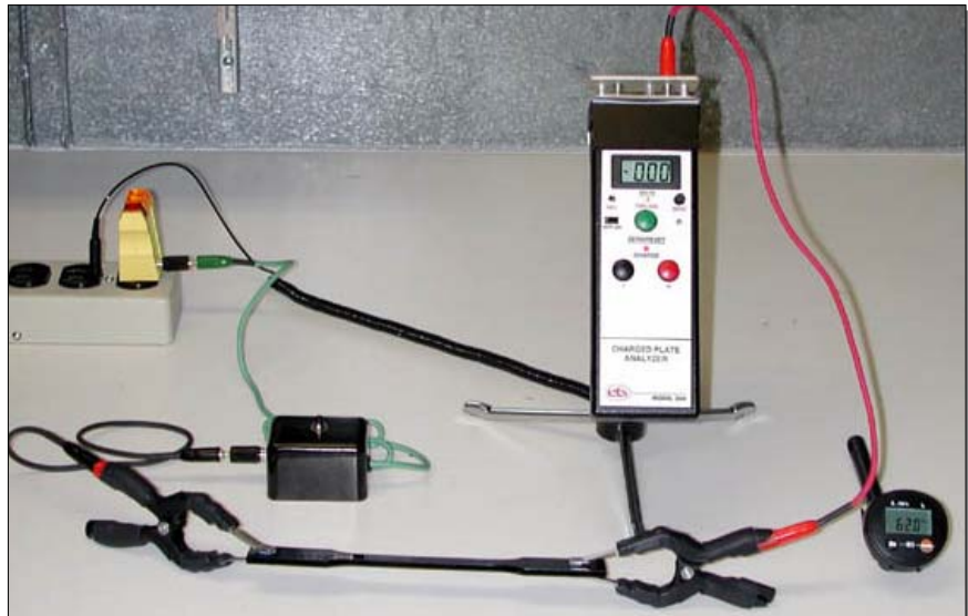
Figure 3-2: Test set up with grounding module