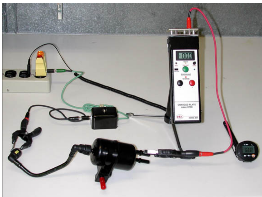
Figure 3-3: Assembly test set up with grounding module