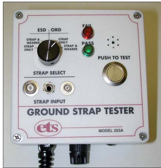
Figure 1.0-1: Model 253A Ground Strap Tester

The Model 253A Ground Strap Tester shown in Figure 1.0-1 is a precision wall or bench mounted test instrument that can test virtually all types of personnel grounding cable/wrist strap and heel strap assemblies. The instrument measures both ESD grounding straps with a nominal resistance of 1 Megohm and ORDNANCE grounding straps with a nominal resistance of 50 kOhms. It can be used to test a strap assembly alone or a complete cable/wrist strap system while on the wrist of the user. The grounded power supply used in the Model 253A enables heel straps attached to personnel to be tested without any additional connections when used in conjunction with grounded floor systems.